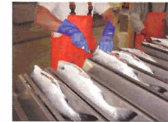
Workers carefully clean troll fish as they travel up the process line.

After the fish have been sorted and weighed they are brought into the fish house for processing. All salmon are headed and hand dressed. They are then loaded into blast freezers, size graded and packed for shipping.