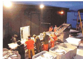
Seine fish are pumped, sorted by species and held in slush totes directly from the catcher boats.