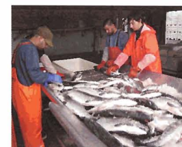
Our graders sort troll fish, looking for marks or scale loss to separate those from our #1 quality fish.

Our troll caught fish are graded by species and quality and, like our seine fish are then