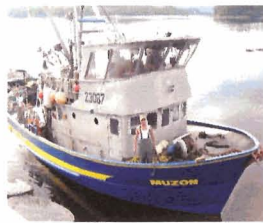
F/V Muzon arrives at our dock to be pumped off after a late July opening.

One of the reasons we are able to provide such a high quality of seine caught fish is the care our fishermen take from the initial catch. All of our seiners are R.S.W., or Refrigerated Salt Water, experienced in handling quality and have outside salmon to work with.