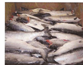
Salmon are packed into 1,000 lb. totes and shipped by the van load.

Our shipper, Alaska Marine Lines provides weekly barges to Seattle from Klawock.