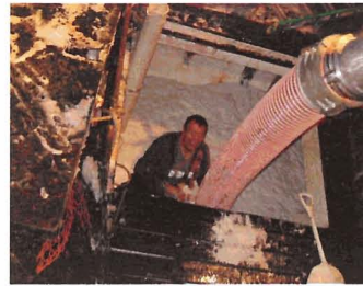
We pump our seine caught fish only once for best quality.

We do not use tenders for our seine caught fish. All salmon are brought to us in the catcher boats and are pumped only once for minimal handling.