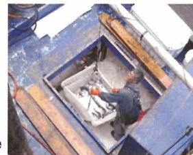
F/V Jolene Ann loads troll fish into the bucket for grading.

Our troll fishery has the same advantage as our seine fishery - location, location, location! From the map you can see that we are very close to the center of the fishing grounds. Our troll tender travels north to Sea Otter Sound and as far south as Cordova Bay.