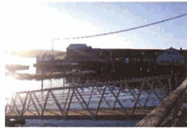
Klawock Oceanside, Inc. salmon processing plant and troll tender, Otter.

The land we operate on is known as the first cannery in Alaska. Our location is only 2-3 hours away from the fishing